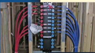
WATER DISTRIBUTION SYSTEMS