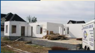
INSULATED CONCRETE FORMS